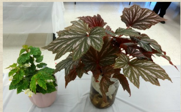
Begonia 'Little Miss Sherrie' (left) Begonia 'Bobbie Price' rooted in water.