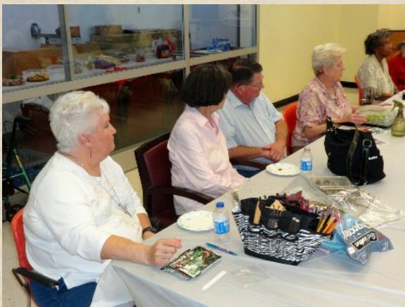
Members paying attention during business meeting.