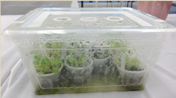
Begonia seedlings ready to be moved up.