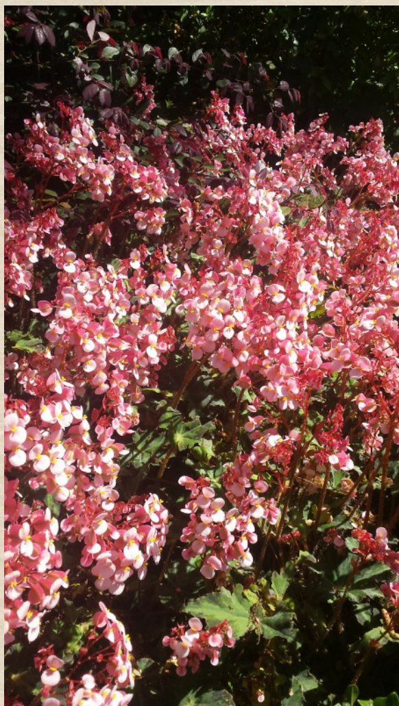
B. "Dotties Eyelash"