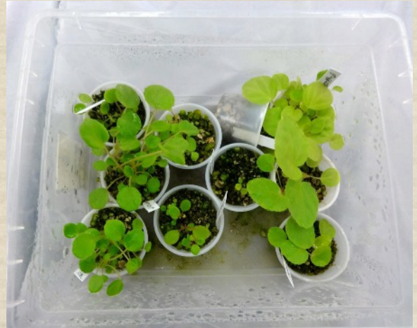
Begonia seedlings ready to be transplanted.