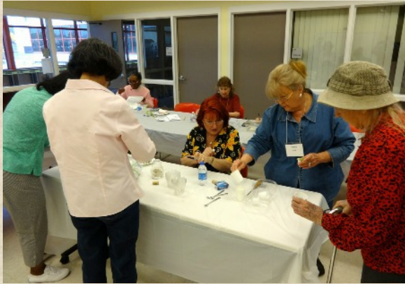
Members examining items for Cheryl's demonstration.